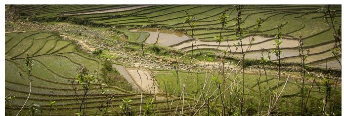
Vietnam (Ulli Meissner ©)

http://www.tellus.org/tellus/author/e-guenther#sthash.spLY9GsY.dpuf